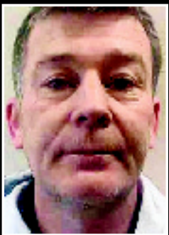
ON THE LOOSE: Kirby