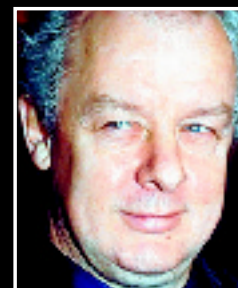
MOVIE: Jim Sheridan